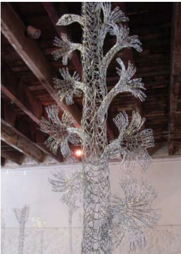
‘Not in My Life-Time’, 2008 (detail of a larger installation) Galvanised wire.