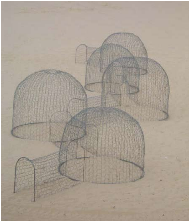
'You Want to do What?!' 2009 (Tow an iceberg from Antarctica). Galvanised wire, 1700 x 200 x 400 mm.